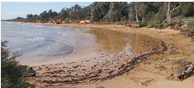
Silverleaves beach, September 2024

We are continuing to seek funding for the revetment through grants and budget bids and we will keep the community updated as things progress.