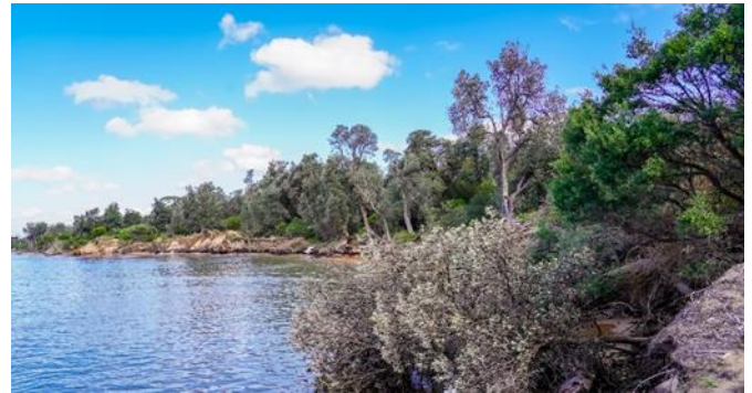
Silverleaves, February 2024

Read more about the adaptation pathways approach in the Marine and Coastal Policy 2020 and Victoria's Resilient Coast Guidelines .