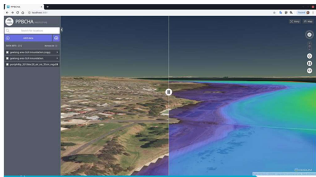
Figure 1: Visualisation of coastal flood inundation hazard within the DSS.