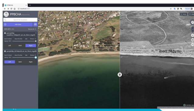
Figure 4: Side-by-side comparison of historical aerial imagery vs recent imagery for Port Phillip Bay within the DSS.

In addition to the coastal hazard's datasets, relevant historical aerial imagery from the 1930s to 2018 for the region, beach profiles, and tidal time series will also be available in the DSS, to allow users to investigate all relevant details for a region.