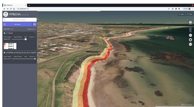
Figure 2: Visualisation of coastal erosion hazard within the DSS.

A sample visualisation of coastal erosion outputs within the DSS is shown in Figure 2. The erosion levels under different sea level rise scenarios will be shown in the form of zones based on probability.