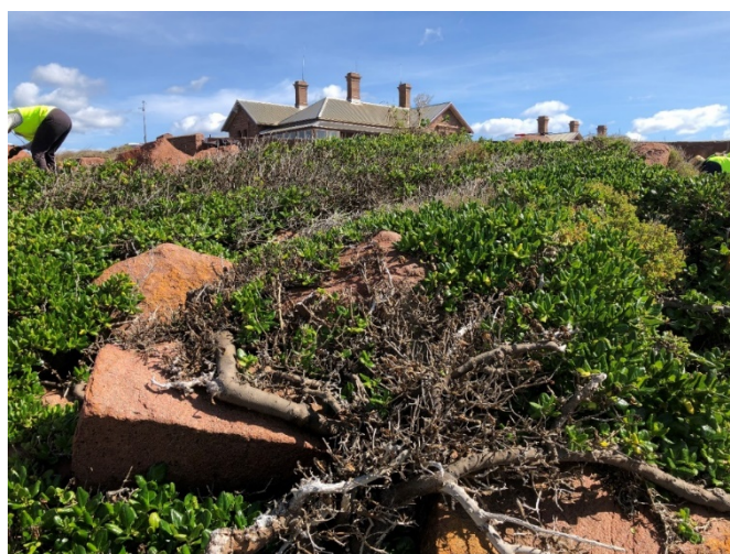
Mirror Bush on Gabo Island.

A number of invasive weeds are spreading throughout the island. The Gabo Weeding Project is intended to remove Mirror Bush ( Coprosma repens ) and help restore Gabo Island's environment to its natural state.