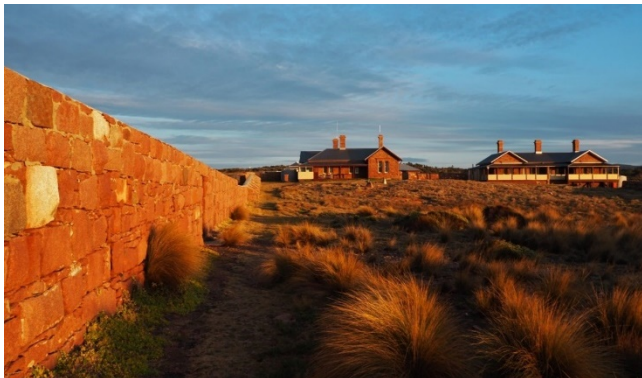
Look Ma, no Mirror Bush

You can find out more about the Friends of Mallacoota at https://environment.victoria.org.au/group-member/friends-mallacoota/ .