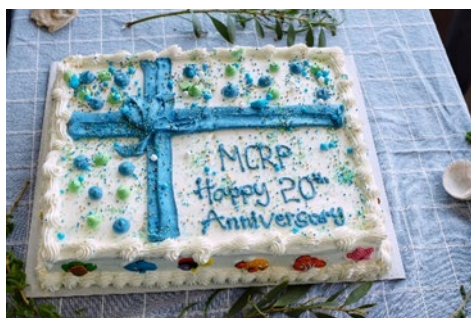
MCRP's celebratory cake (photo by Peter Lamshed).

The event also featured a range of activities including a smoking ceremony by a Bunurong Elder, rock pool rambles, and touch tanks. Congratulations MCRP on such a wonderful celebratory event, supported by their 2021 Coastcare Victoria Community Grant!