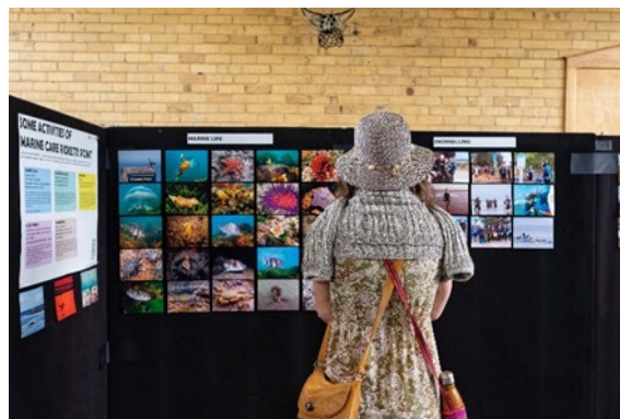
MCRP's info boards at the celebration.