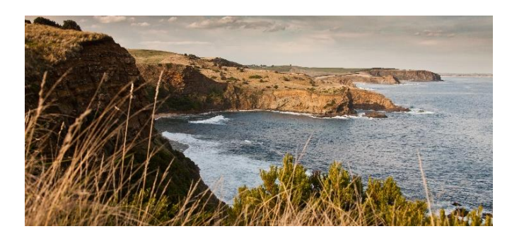
The Inverloch RaSP

RaSPs facilitate work across multiple agencies and across different marine and coastal land. Partner agencies can be government or non-government bodies with interest in or connection to marine and coastal environments. They may include DELWP, Traditional Owners, public land managers and other major asset owners.