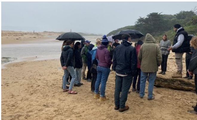
Apollo Bay delivered a beautiful sunny morning, quickly followed by a wet and wintery afternoon.