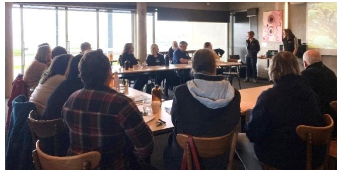
A fabulous mix of participants at Warrnambool.

Volunteers benefited from on-Country walks and cultural heritage knowledge sharing, heard personal accounts of family history, learnt about coastal land management, and had the chance to handle ancient indigenous artefacts.