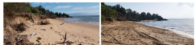
Left: Silverleaves foreshore looking east, prior to beach nourishment, 21 August 2023. Right: Following beach nourishment, 25 August 2023.

Bass Coast Shire and DEECA continue to work together to closely monitor the shoreline at Silverleaves ahead of the coastal process study works.