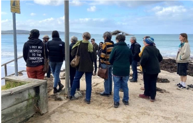
Participants soaking up knowledge from Ash of Wadawurrung Traditional Owners Aboriginal Corporation, near Anglesea.

Coastcare Victoria recently joined forces with Traditional Owner Corporations across the state to deliver seven hugely popular workshops to our valued marine and coastal volunteers from across Victoria. The sessions were led by Traditional Owners from respective areas and were open to all Coastcare Victoria community networks.