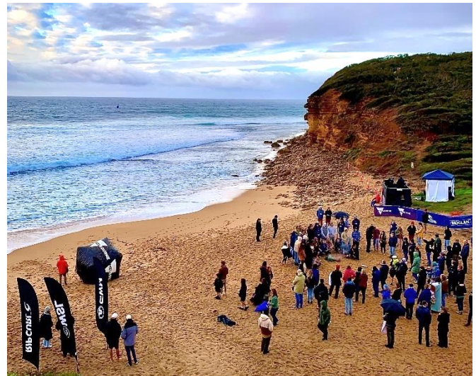
The world's best longboarders gather for the Welcome to Country and Official Opening Ceremony for the Bells Beach Longboard Classic, 30 August 2023.

If you'd like to know more about consent for use, development and works on marine and coastal Crown land, please visit www.marineandcoasts.vic.gov.au/marine-coastal-management/guidelines .