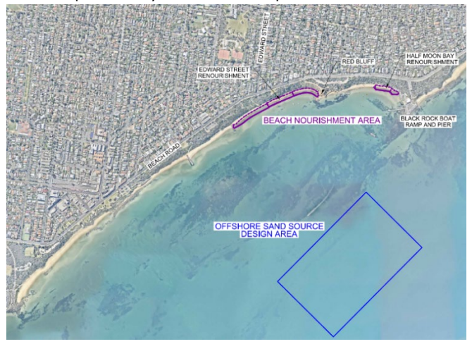
Figure 1: Site location map.

Construction is planned to commence in March 2021, pending disruptions relating to weather and COVID-19 restrictions. The works are expected to be completed by the end of April 2021.