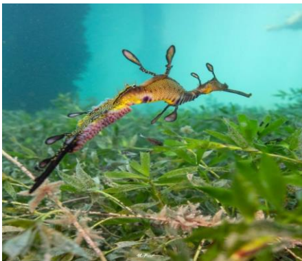
Weedy seadragon.

For questions about the program, please email enviro.grants@delwp.vic.gov.au