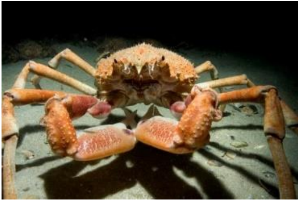
Giant Spider Crab ( Leptomithrax gaimardii ).

Deakin University are in the final stages of completing the first comprehensive assessment of the Giant Spider Crab ( Leptomithrax gaimardii ).