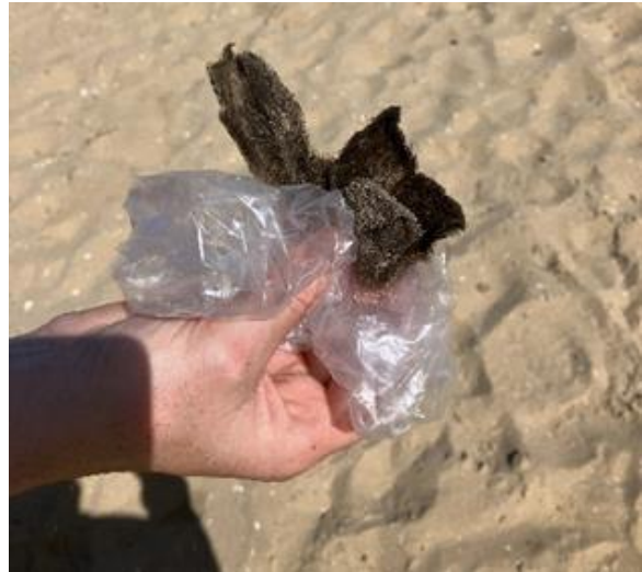
Fur seal sampling for lab analysis.

The visit provided a valuable opportunity to retrieve fur samples that can be taken to the lab for further analysis.