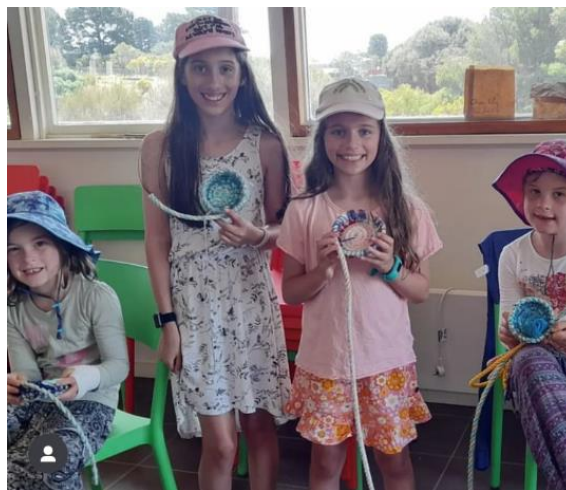
Ghostrope Weaving workshop – Selkie Knots.