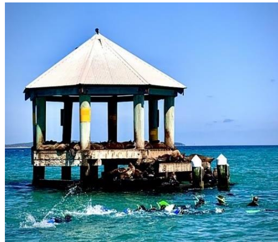
A school group snorkelling with seals at Chinaman's Hat.

The inspections included ageing wharfs in the Queenscliff Harbour, proposal for a major rubbish removal in the Queenscliff cut, the redeveloped Queenscliff boat ramp, navigational aids at Popes Eye, wildlife challenges at Chinaman's Hat and a compliance inspection for the dredging activity around the Queenscliff ferry terminal.