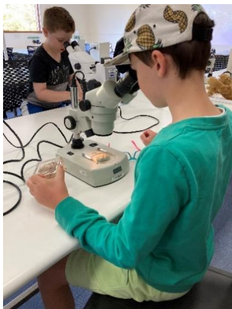
Children discovering marine science – Deakin University.