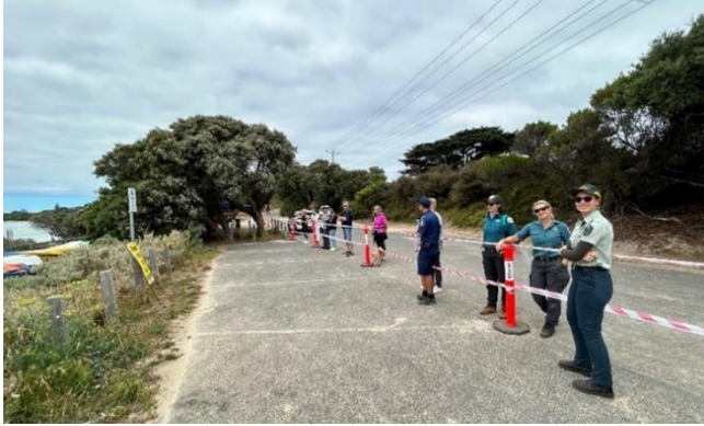
Giving the seal space.

Due to the public safety risk and sensitivity of these seals when approached by humans, a safe zone was quickly set up for the seal, with fencing, signage and community awareness implemented throughout the three weeks.