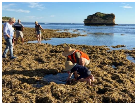
Rockpool Ramble at Crofts Bay – Habitat Connection.

To access videos, webinar recordings, blog posts and more from this year's Summer by the Sea, visit summerbythesea.vic.gov.au