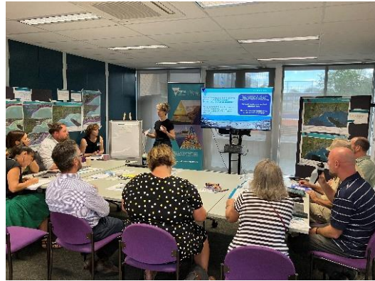
Partner agencies and community members participating in Roundtable focus group discussion.

As the Resilience Plan is being put together in the coming months, you can have a look at the maps, factsheets and plenty of other project content at marineandcoasts.vic.gov.au/coastal-programs/cape-to-cape-resilience-project