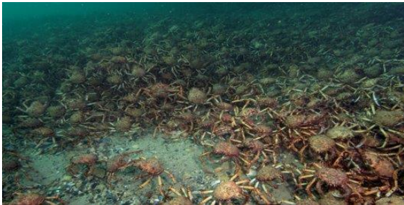
Giant Spider Crab ( Leptomithrax gaimardii ).

Large numbers of the Giant Spider Crab migrate into Port Phillip Bay from May to July each year to aggregate and moult. They are vulnerable to natural predation and human take during this period. Little is known about population numbers and dispersal patterns.