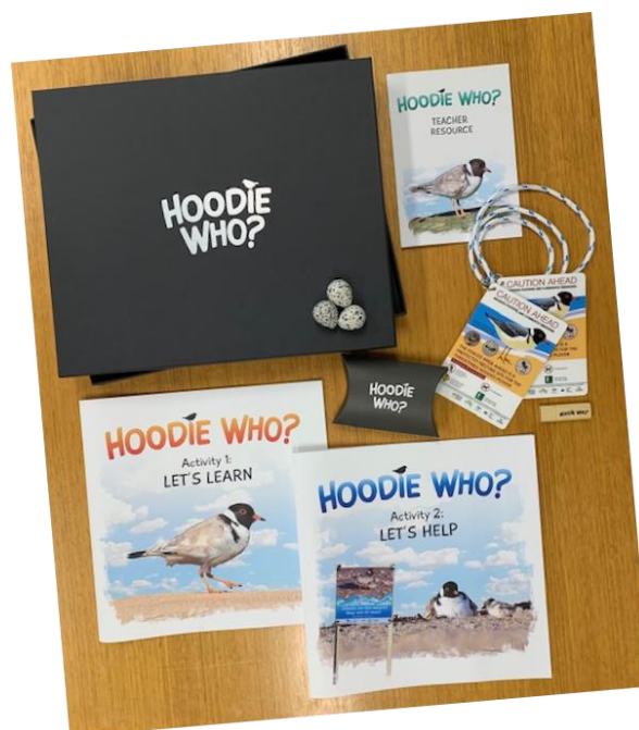
The Hoodie Who? resource

For more information contact the Friends of the Hooded Plover (Mornington Peninsula) Inc. hploversmornpen@gmail.com