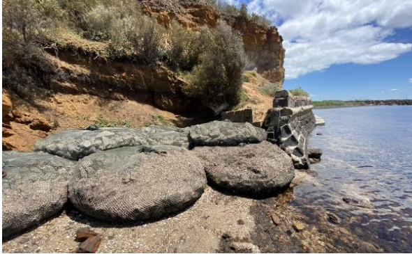
Temporary rock bags address erosion of the Portarlington cliff face at the eastern end.