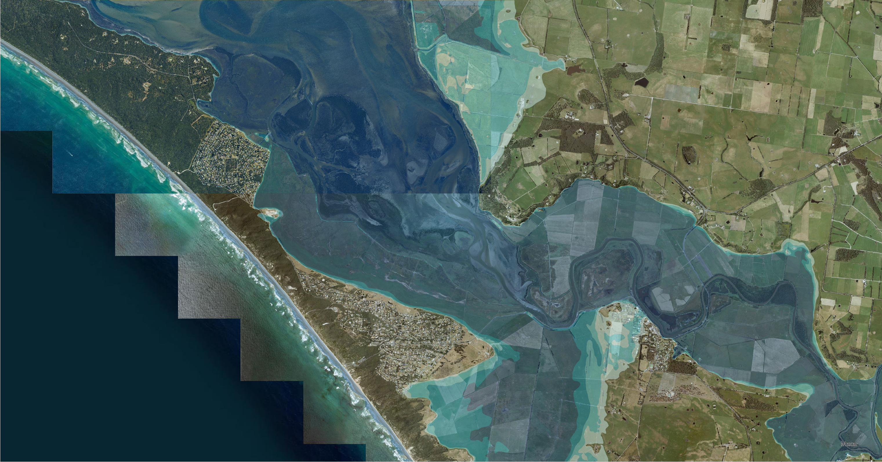
Storm tide inundation extents