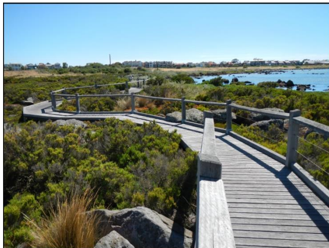
Boardwalk at Jawbone Flora and Fauna Reserve and Marine Sanctuary.

For more information and project updates visit marineandcoasts.vic.gov.au/coastal-programs/port-phillip-bay-western-shoreline-regional-and-strategic-partnership