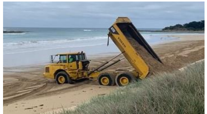
Truck depositing sand at the Southern end of Mounts Bay.