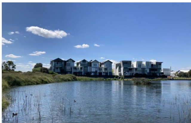
Cheetham Wetlands.