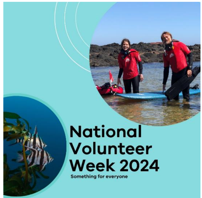
Victorian National Park Authority's Great Victorian Fish Count event, funded in part by Coastcare Victoria.

To nominate someone special, either in the individual category, or organisation category, visit volunteeringvictoria.org.au/events/awards/