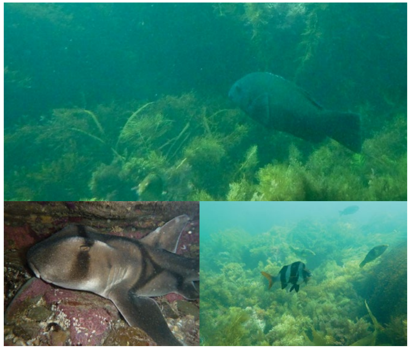
Blue Groper (top), Port Jackson Shark (bottom left), Magpie Perch (bottom right)

Reefwatch can use more support in South Gippsland. Contact Rod Webster at Bunurong Environment Centre on 56 743 738 or 0434 145 816 for more information on how you can contribute.