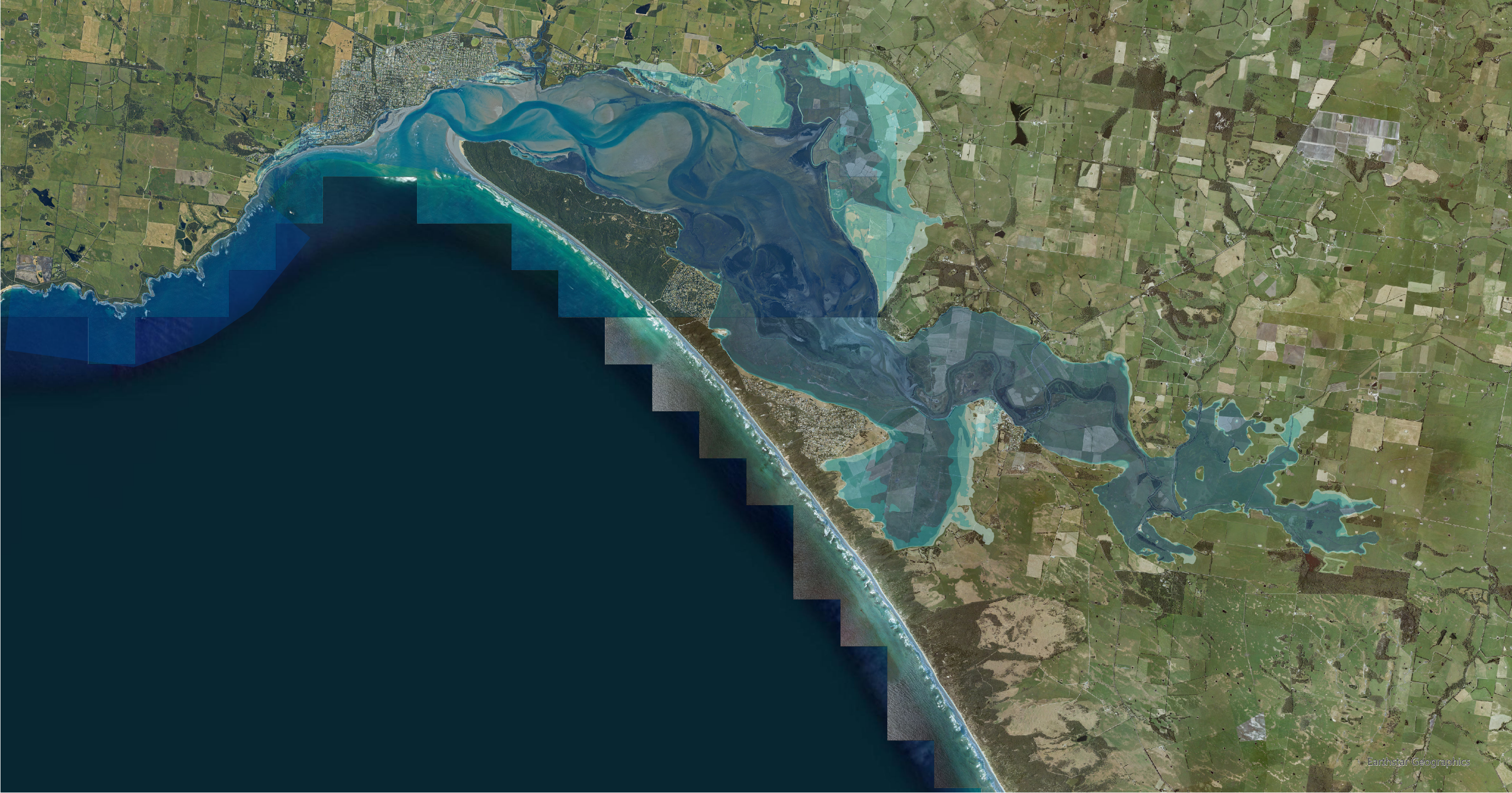
Storm tide inundation extents