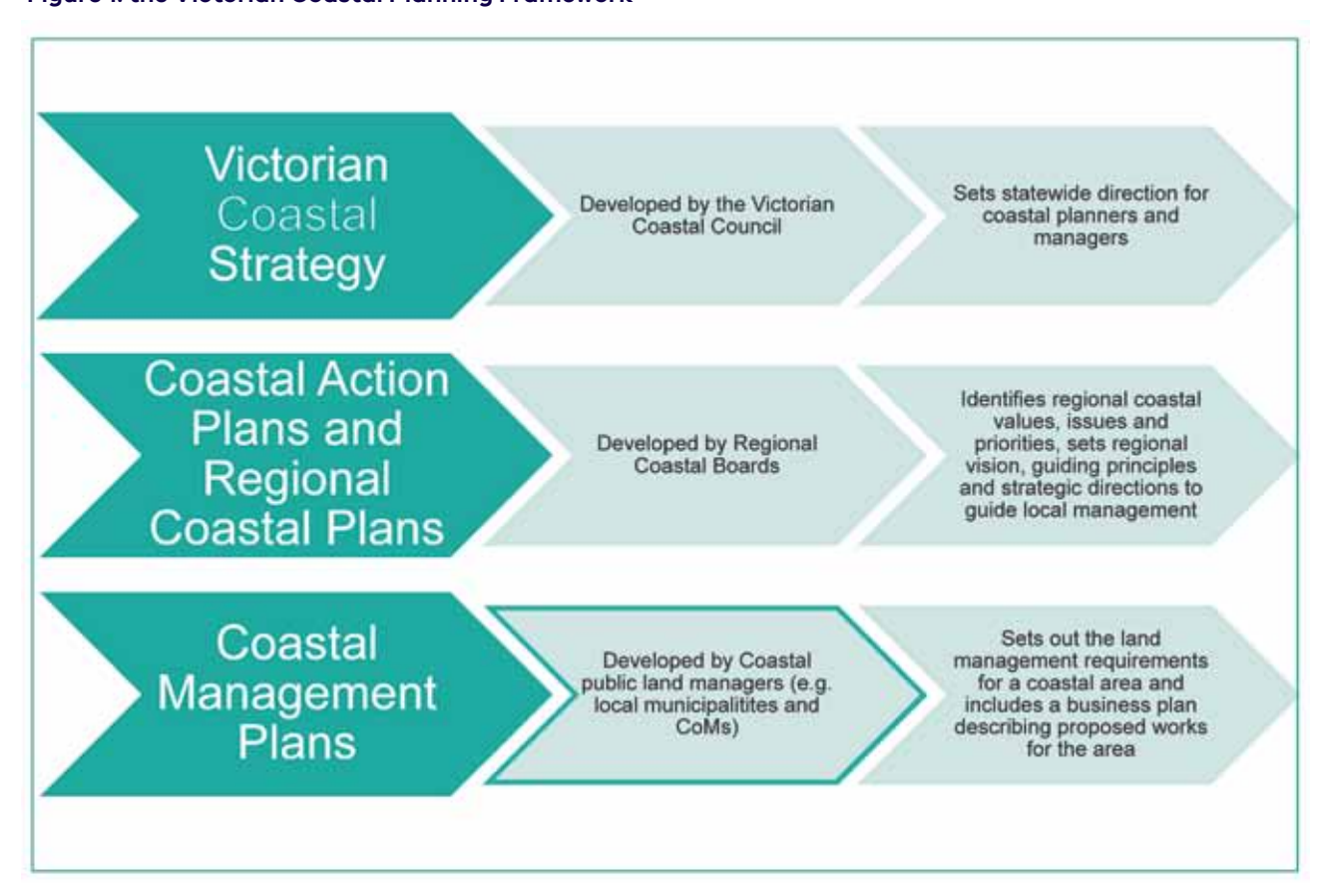
Figure 1: the Victorian Coastal Planning Framework

Victorian Best Practice Guidelines for Assessing and Managing Coastal Acid Sulfate Soils 2010