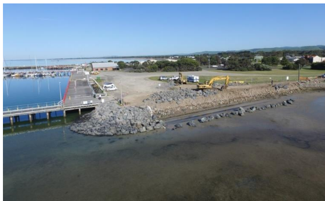
Port Welshpool Seawall, during construction.

Inspection of the original masonry seawall in 2022 revealed much of it to be in very poor condition, with erosion occurring behind the wall. The seawall's poor condition threatened road access to the jetty and ferry terminal – a hub for public recreation and commercial activities.