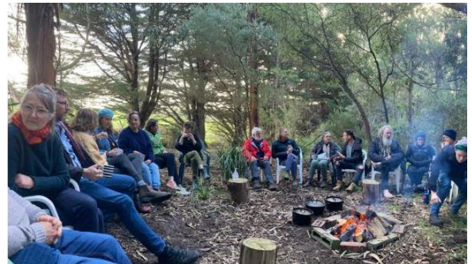
Seaweed symposium 2 – Participants gather around the campfire, delving into discussion and seaweed damper.

A massive congratulations to Edible Gardens Group for hosting a well-attended, highly educational event!