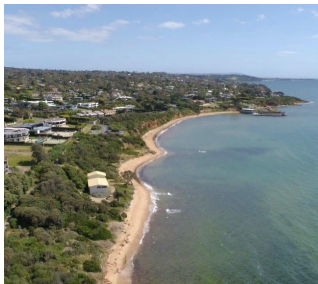
Canadian Bay (Mount Eliza).

For more information, visit marineandcoasts.vic.gov.au/coastal-programs/port-phillip-bay-coastal-hazard-assessment