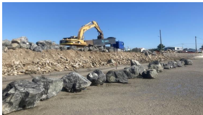
Port Welshpool Seawall, during construction.

The project was funded through the VicCoasts program as part of the 2022-23 State Budget.