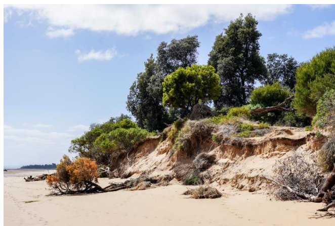
Erosion at Silverleaves Foreshore, February 2024.

Coastal Process Studies are underway for 21 sites in the west of Gippsland, including the Silverleaves Foreshore.