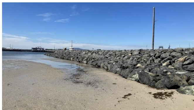
Port Welshpool Seawall, construction completed. December 2023.